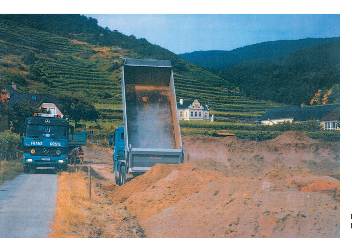
Duernstein, construction work in front of the Kellerschloessel

At the General Assembly of the World Heritage Committee it was demanded that the height of the hotel tower be reduced to 47 metres.