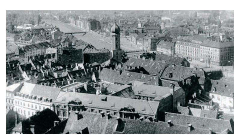
Graz, state of the city centre at the beginning of the 1960s

Through a re-designation of areas within the immediate surroundings the view has already been disturbed. Now a further residential settlement, the result of a competition, is meant to be constructed. The key question should have been: Is it generally adequate to erect buildings close to the Kellerschloessel? The decision to grant a building permit affects the World Heritage site and the result of this competition poses the problem whether the consistent limitation of exclusively "modern architecture" is justified in such a region.