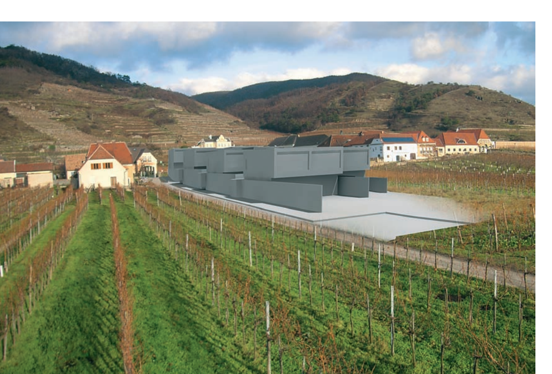
Duernstein, design for buildings to be erected in front of the Kellerschloessel