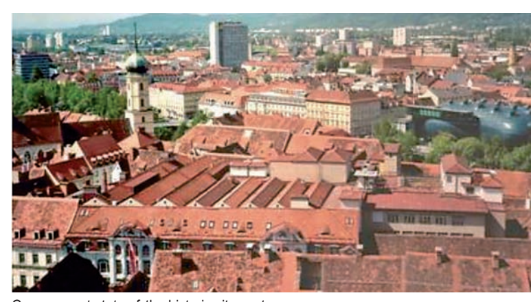
Graz, current state of the historic city centre