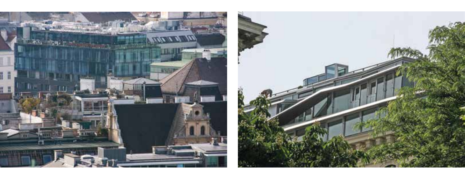
Figs. 3 and 4: The eroding traditional roofscape as part of the UNESCO World Heritage site "Historic Centre of Vienna"

ICOMOS Austria started campaigning for better practice in 2018 by intensifying the dialogue at eye-level with the site managers about architectural qualities in general and the essential attributes of their site in particular.