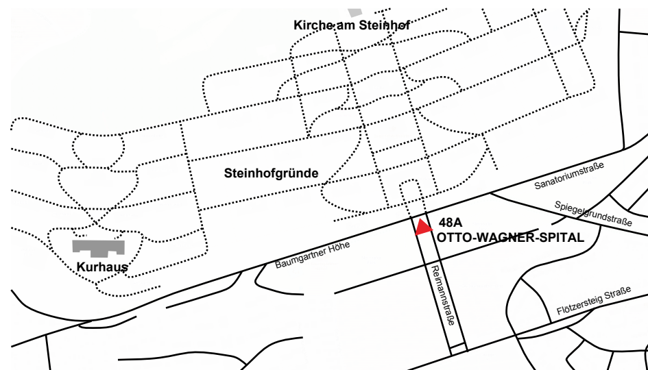
Kurhaus am Steinhof, Baumgartner Höhe 1, A-1140 Vienna Bus 48A/ Station: OTTO-WAGNER-SPITAL